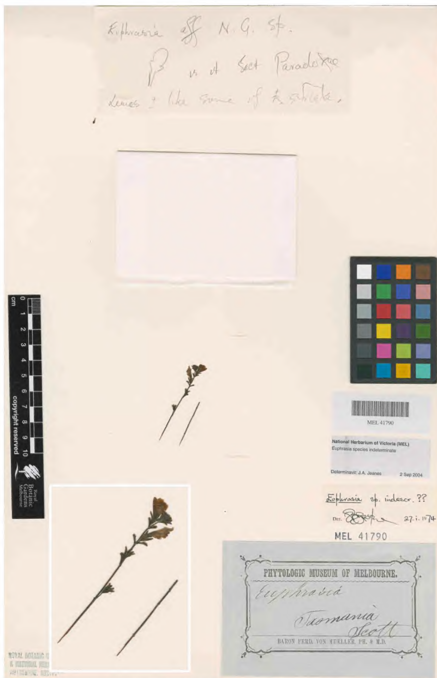
Fig. 6. The old Scott specimen from Tasmania in the National Herbarium of Victoria (MEL 41790), enlarged in inset (reproduced with permission from the Royal Botanic Gardens Melbourne).